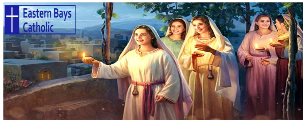
Gospel Matthew 25.1-13