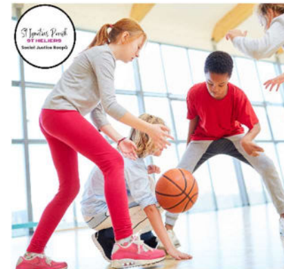
3-5PM | 29 OCTOBER 2023 AUCKLAND NETBALL CENTRE | 7 ALLISON FERGUSON DRIVE

The next one will be on the 25 th of November