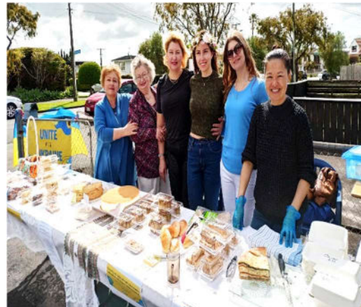
Sunday 15 th October at St Ignatius Parish