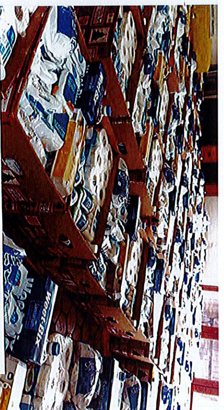
Christmas 2014 hampers awaiting delivery to 66 families from Glenbrae State and St. Pius Schools.